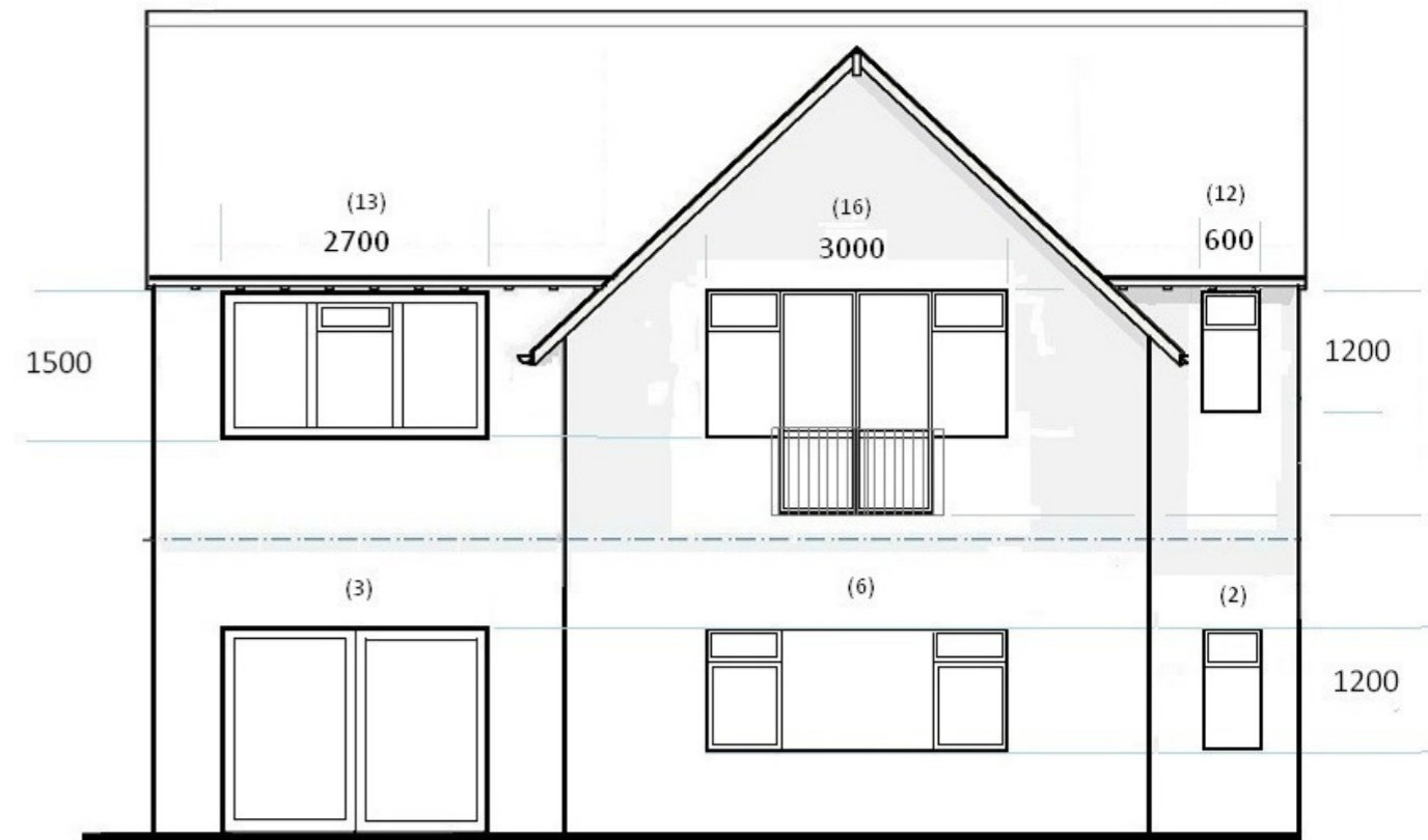
Rear (South) Elevation